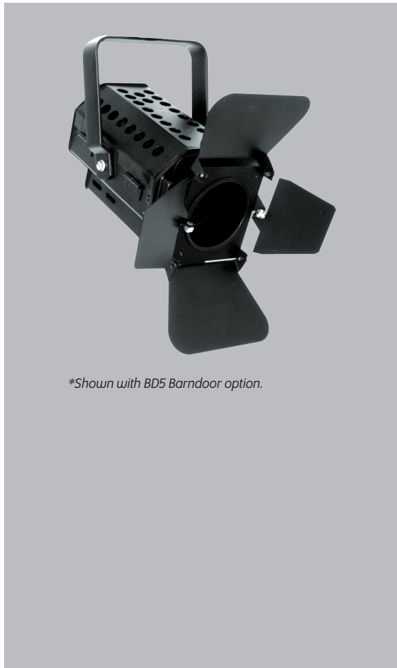
*Shown with BD5 Barndoor option.

The C3MR16L combines theatrical style with architectural function. The unit accepts energy efficient MR16 lamps in a variety of beam spreads. External accessory holder accepts louvers, barn doors, hoods and filters. Hinged top for easy re-lamping. Comes in standard black, white and silver finishes. Custom colors are available by request and at an additional charge.